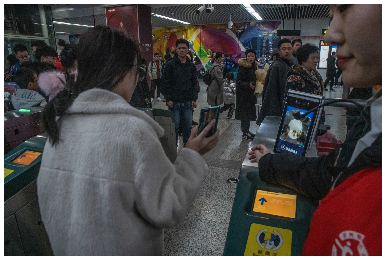
A facial-recognition scanning system at the entrance of the subway station near Huating Apartments.