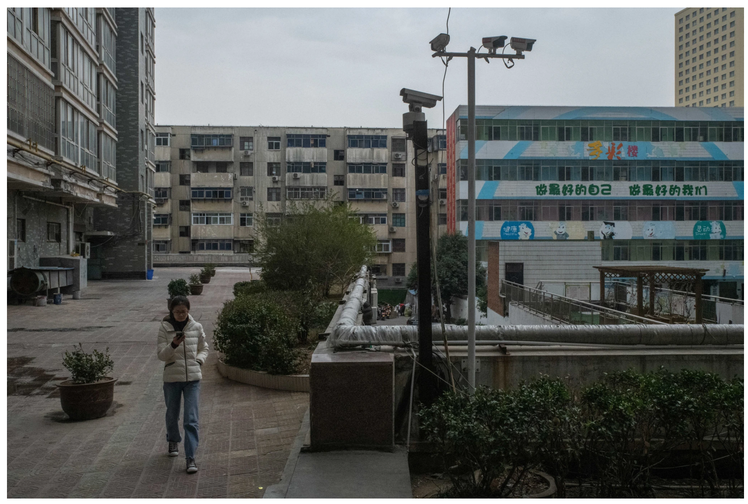
Surveillance cameras at the Huating Apartments residential complex.