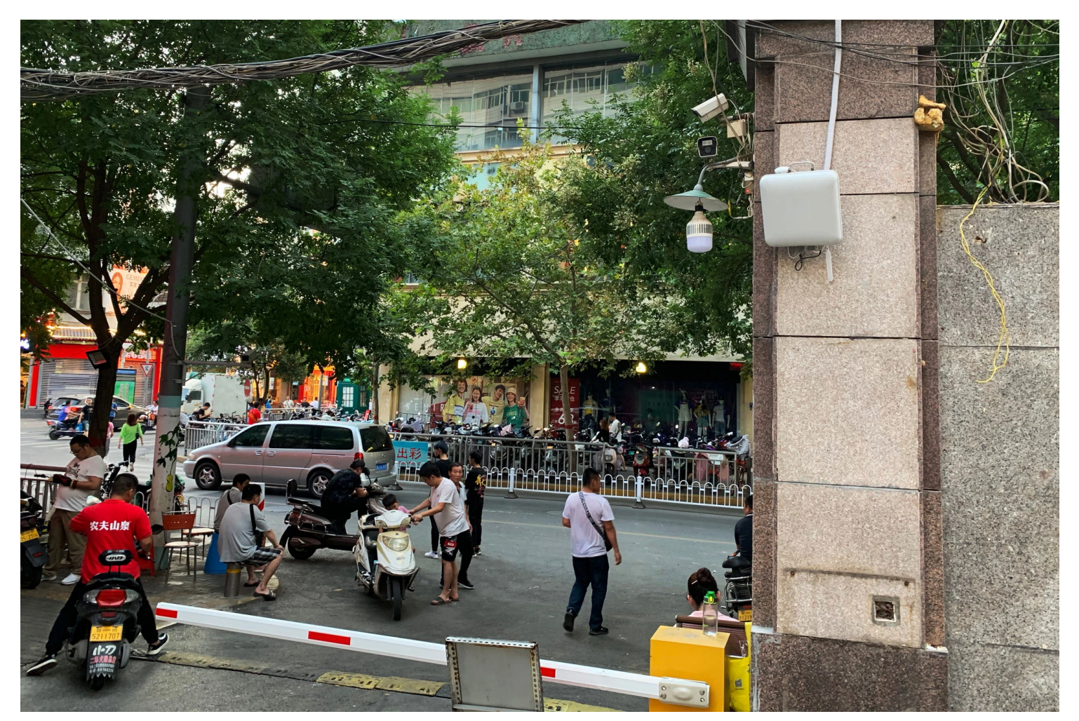
Phone identification scanners - called IMSI catchers - collected identification codes from mobile phones at the entrance of the complex. Paul Mozur

Even for China's police, who enjoy broad powers to question and detain people, this level of control is unprecedented. Tracking people so closely once required cooperation from uncooperative institutions in Beijing. The state-run phone companies, for example, are often reluctant to share sensitive or lucrative data with local authorities, said people with knowledge of the system.