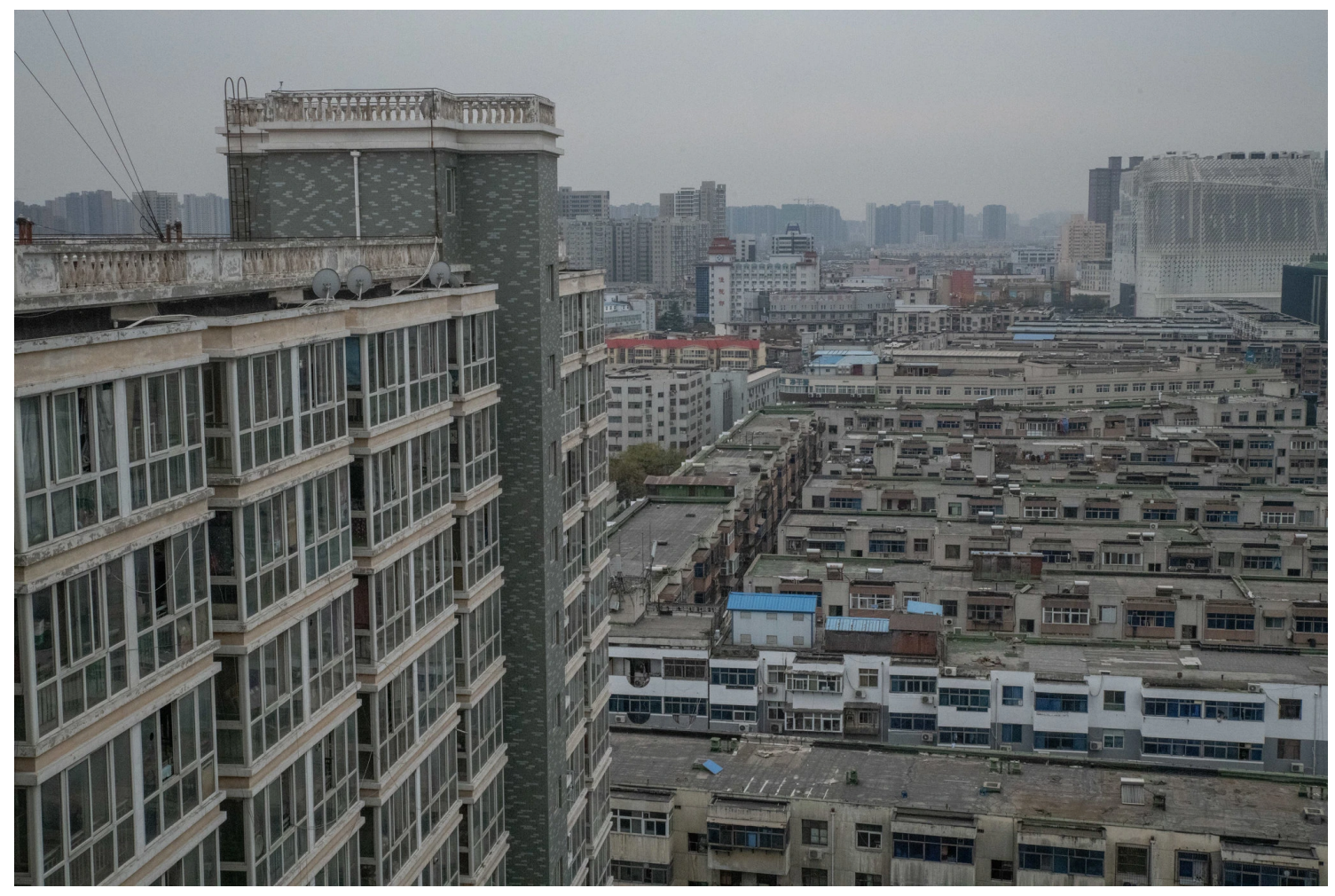
The Huating Apartments residential complex, where a surveillance system matches residents' faces to phone numbers.