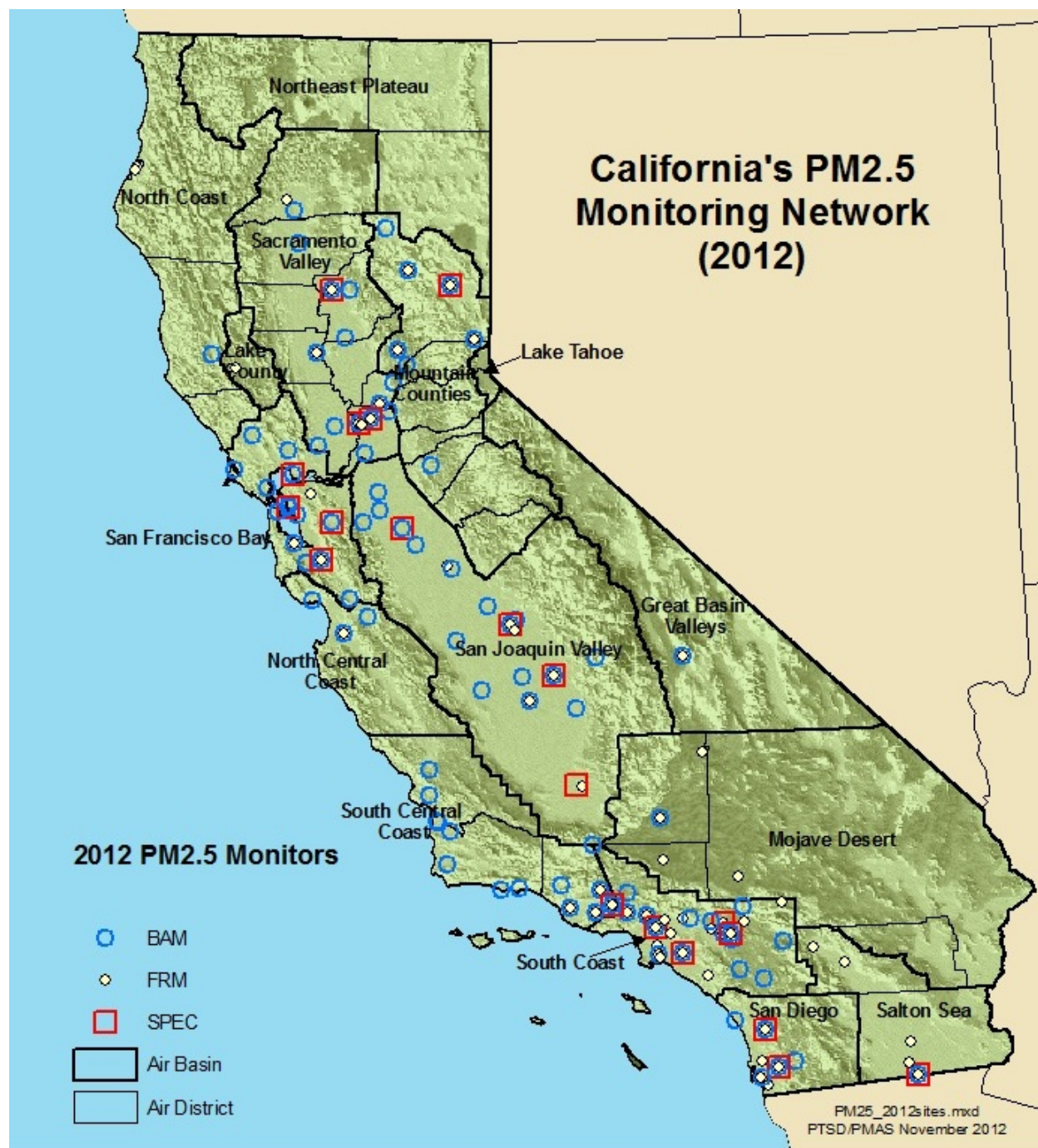
Figure 1: PM 2.5 Monitoring Stations in California