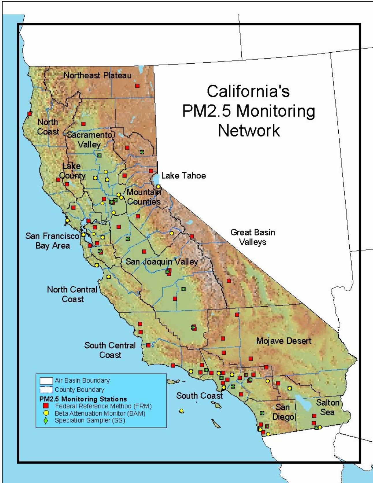
Figure 1: PM2.5 Monitoring Stations in California