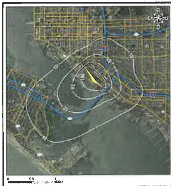
Figure V-1: Estimated Near-Source Cancer Risk (Chances per Million People) from the BNSF San Diego Railyard

The BNSF Railyard in Barrio Logan is located less than a quarter mile from Perkins Elementary School. According to a Health Risk assessment of the railyard 3 that was done by CARB in 2008, the estimated cancer health hazard from the railyard is between 50 and 100 cancers per million. The 10 per million cancer risk isopleth goes far beyond the Barrio Logan community, taking in a wide swath of San Diego's downtown and adjacent communities, and extending across San Diego Bay into the City of Coronado: