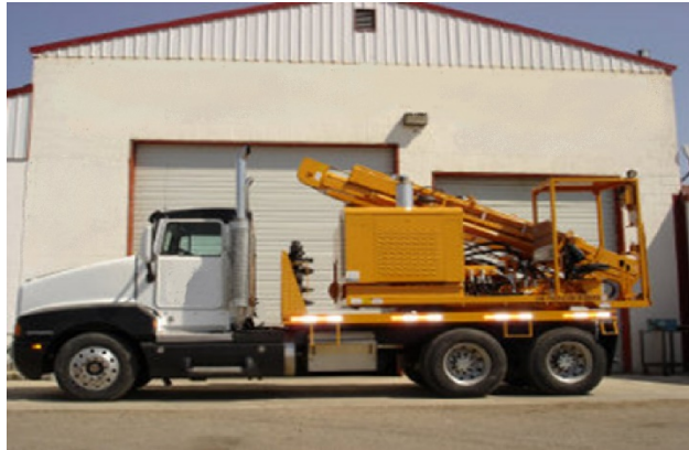
Vacuum Pump Truck