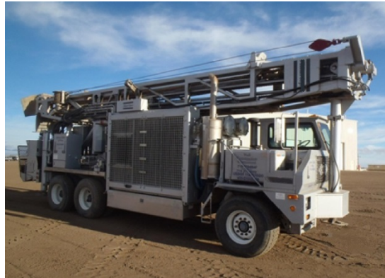
Work-over Drilling Rig