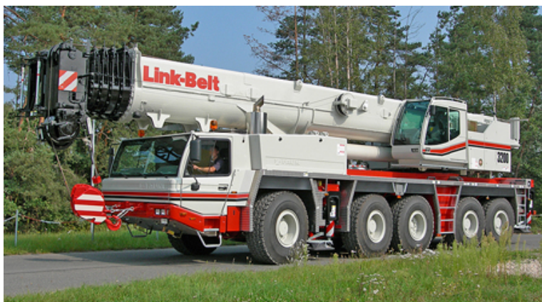
Conventional Truck Crane