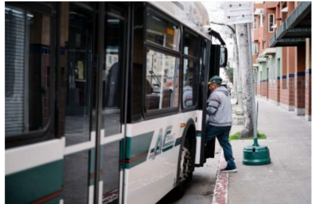
A man catches an AC Transit bus on International Boulevard in Oakland in 2019. The coronavirus is forcing the system to consider drastic cuts.

As San Francisco braces for a wholesale gutting of its bus system , AC Transit is contemplating similar cuts in the East Bay.