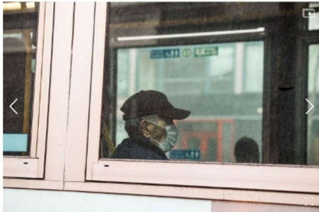
1 of 2 A Muni passenger wears a mask while riding on Market Street during the second week of shelter-in-place orders in March.

San Francisco, which once packed 68 crowded bus lines into its lean streets, stands to lose most of them as the pandemic sinks its transit budget and steers riders into cars.