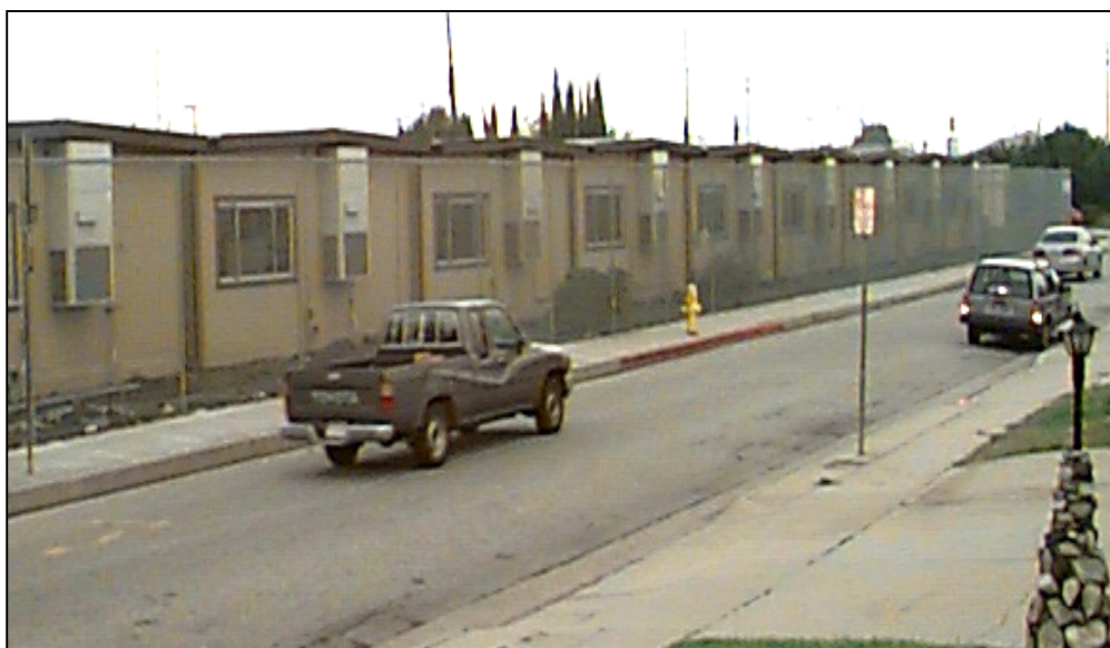
Vehicle traffic near air intakes of classrooms can be a major source of small particles, volatile organic compounds, and other pollutants.

One possible explanation for the increased fine particle counts is that portables may be closer to vehicle traffic and other outdoor particle sources. In this study, over 50% of portable and traditional classrooms were located within 50 feet of parking lots and roadways. Portables usually have wall-mounted rather than roof-mounted HVAC units, and are sometimes sited with their air handling units near roadways and parking lots for security reasons, which could lead to increased particle infiltration into those rooms. Recent research (Sioutas et al. , 2003) has shown dramatically higher levels of fine particles very near roadways. Other likely sources of particles (and VOCs and other pollutants) include portable equipment such as leaf blowers and lawn mowers used for landscape maintenance. In addition, carpets and rugs were found more often in the portable classrooms, and could be a source of the particles, either due to resuspension of previously deposited particles or chemical reactions at the carpet surface that produce fine aerosols (Fan et al. , 2003). Further analysis is needed to confirm the relationships of potential indoor and outdoor particle sources, and to examine the particle count patterns throughout the day.