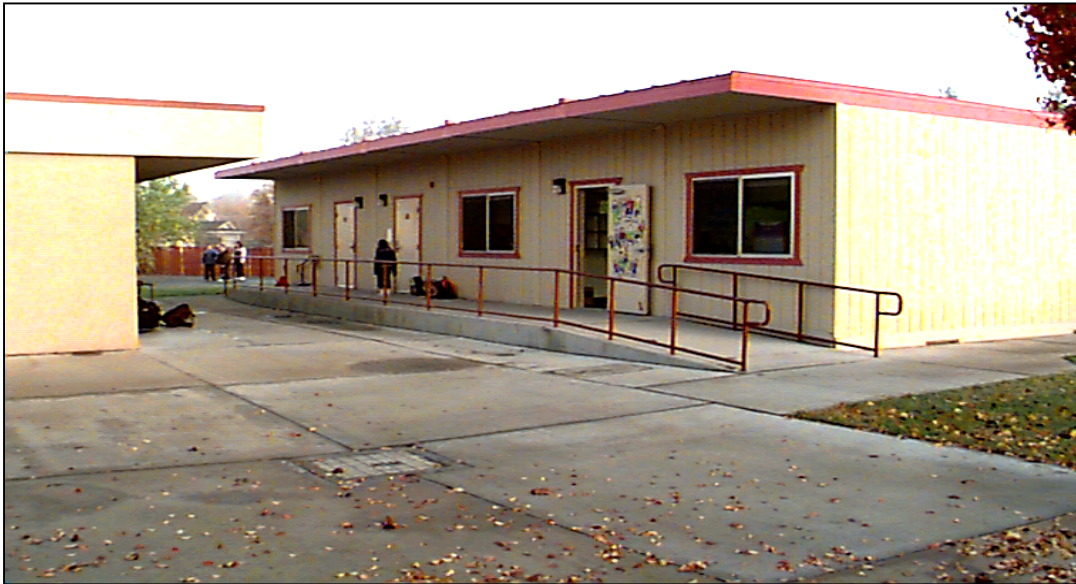
Typical portable (relocatable) classrooms.

2001 school year were portable classrooms. It is estimated that about 80,000 to 85,000 are currently in use as classrooms in California.