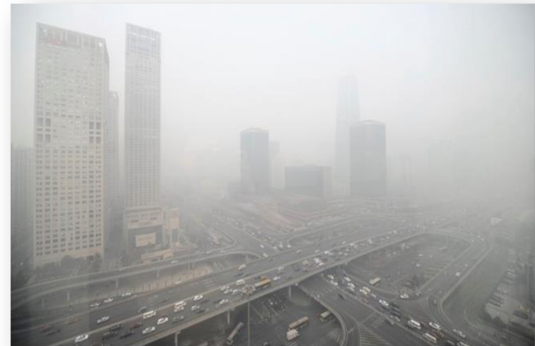
Beijing 2013