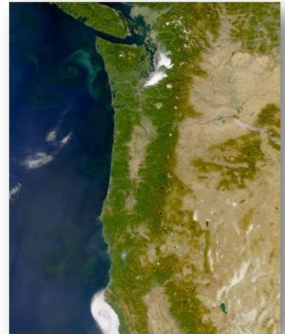
Pacific Northwest (NASA)