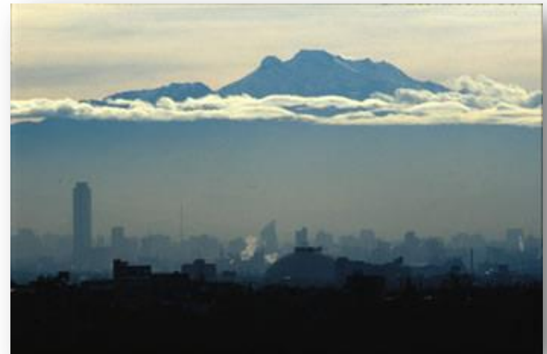
Mexico City