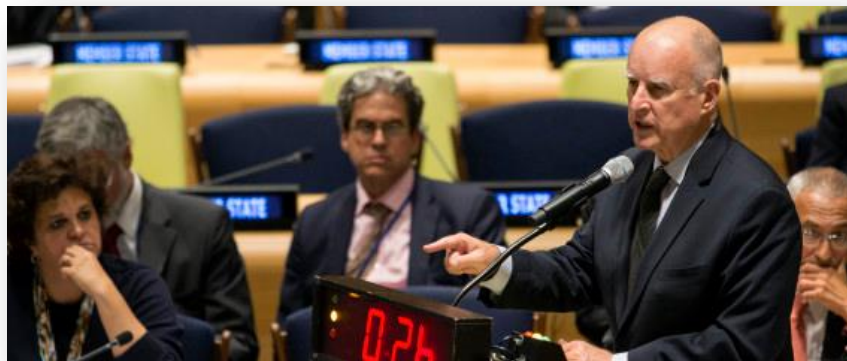
UN Climate Summit, September 2014

-- Governor Brown, UN Climate Summit, Sept. 2014