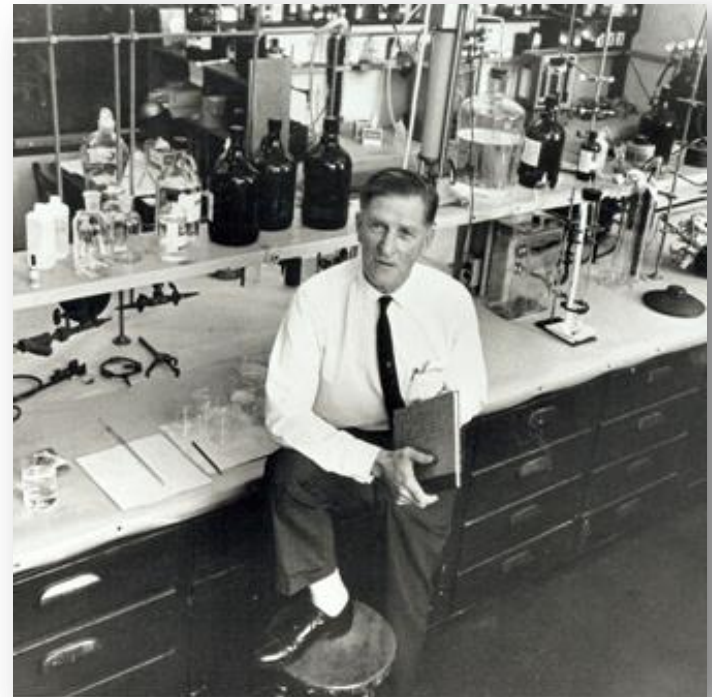
Dr. Arie Haagen-Smit