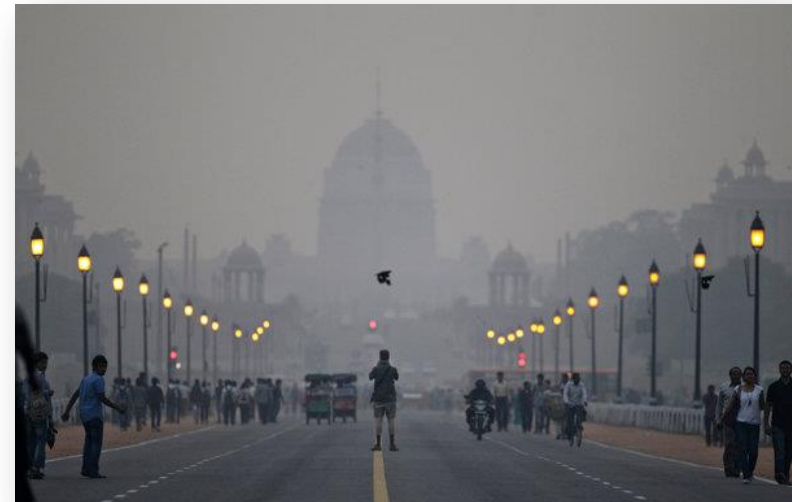
New Delhi