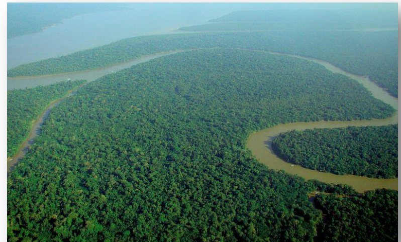
Amazon Rainforest