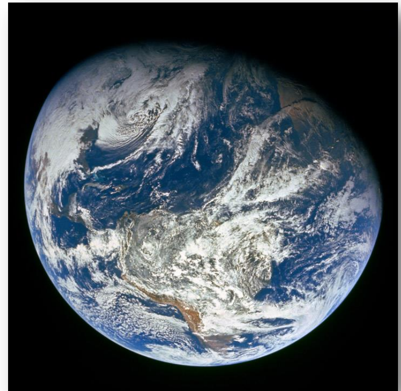
Earth from space