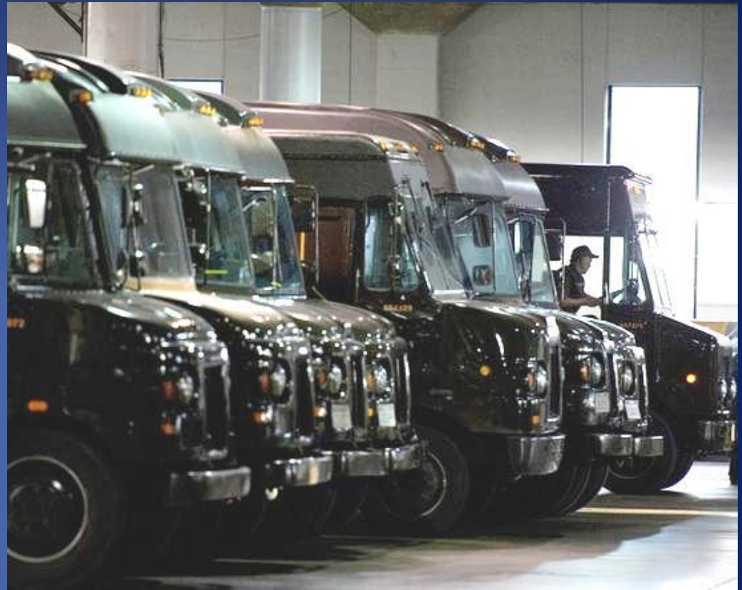
UPS Zero-Emission Truck Press Event February 2013