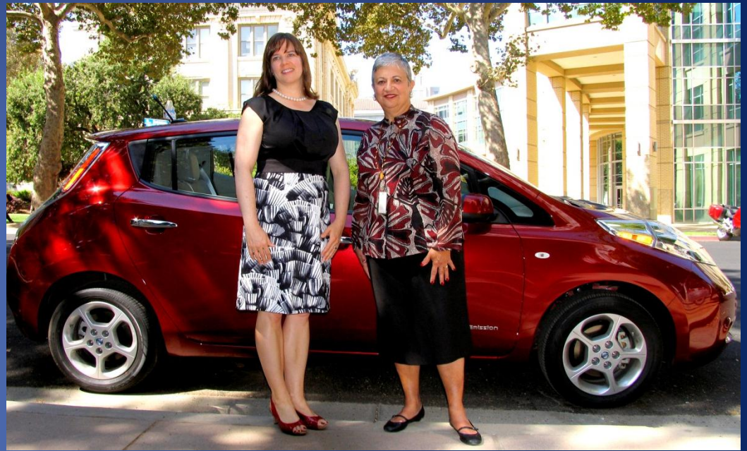
10,000 th Rebate Press Event September 2012