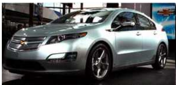
Plug-in Hybrids (using zero-emissions fuel)