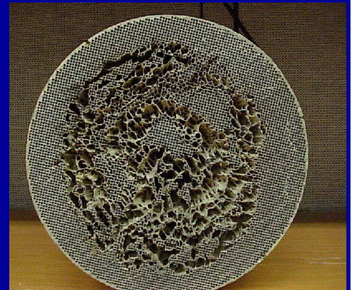
Example of typical failure