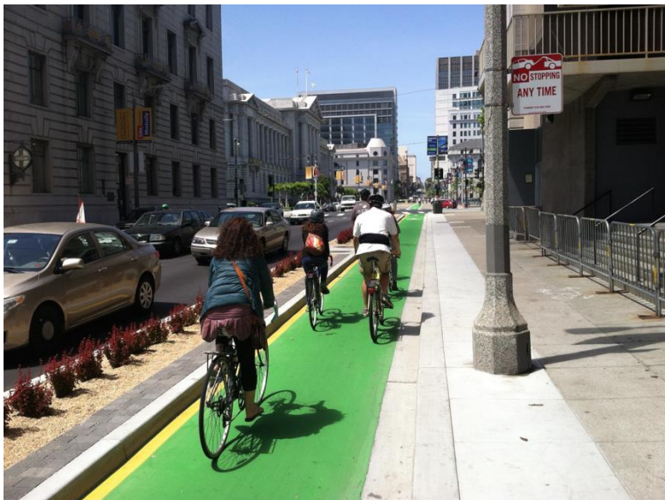
Figure 4. Class IV Cycle Track

Source: Fitch, Thigpen, Cruz, & Handy (2016)