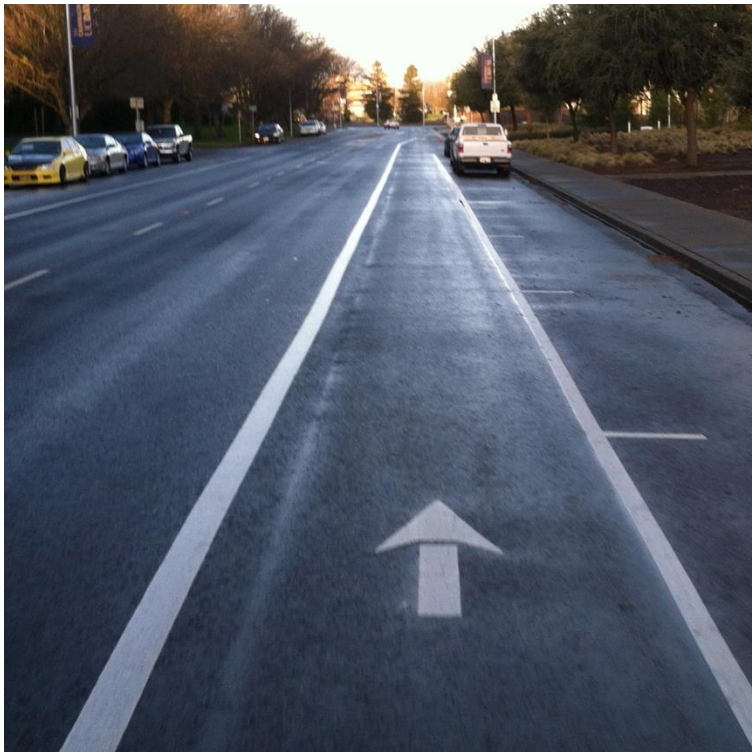
Figure 2. Class II Bicycle Lane