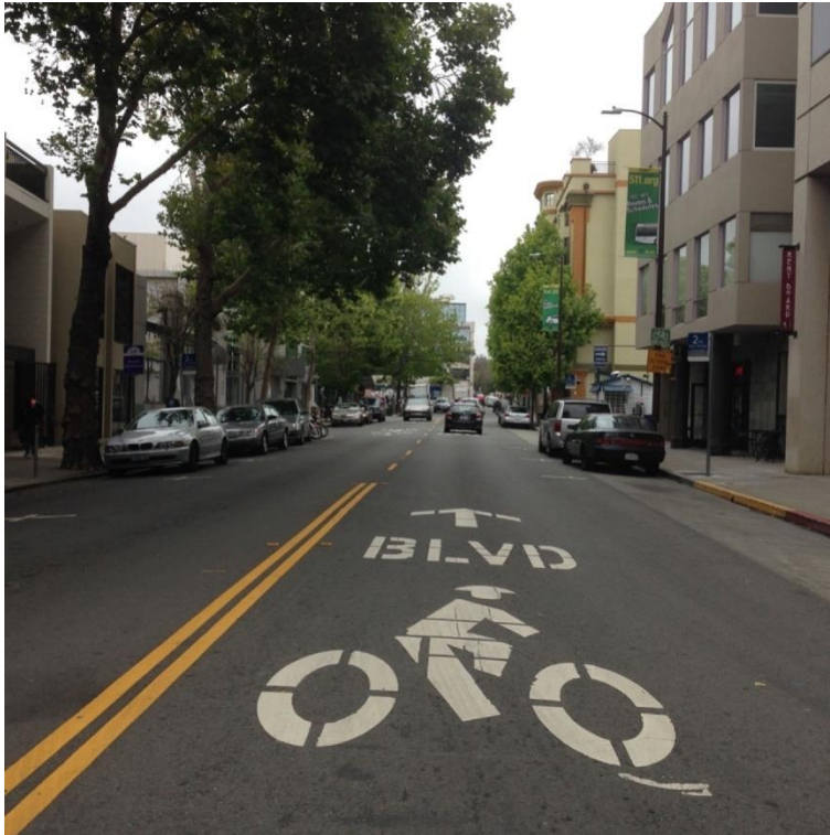
Figure 3. Class III Bicycle Boulevard