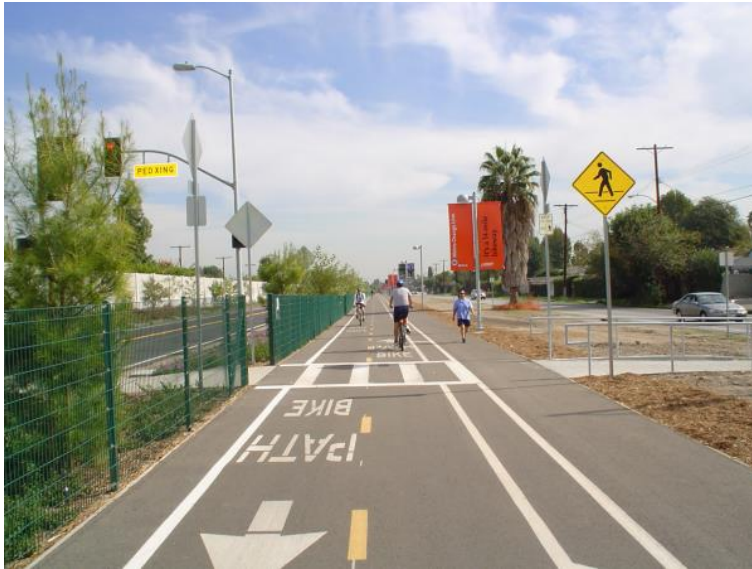
Figure 1. Class I Bicycle Path (Los Angeles Orange Line Bike Path)