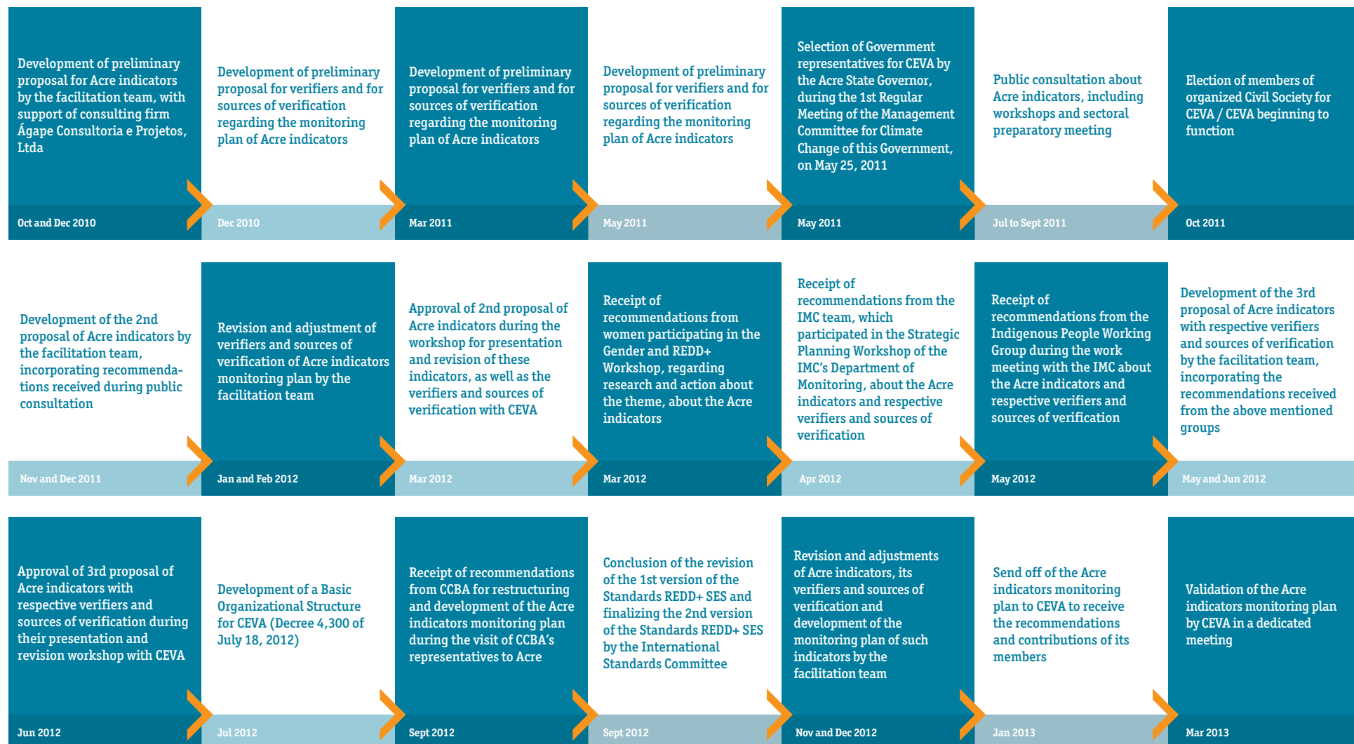
Flow chart 1: participatory process for building and validating the Acre indicators and the monitoring plan