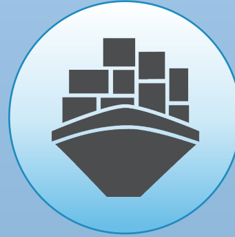
Chapter 7: Marine Vessels