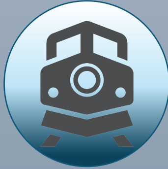
Chapter 6: Locomotives