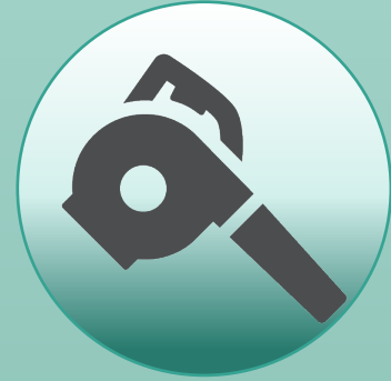
Chapter 9: Lawn & Garden Equipment Replacement