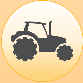
Chapter 5: Off-Road Equipment