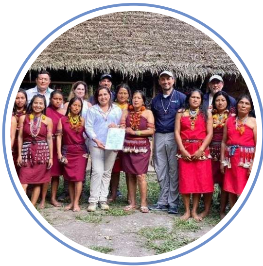
Jurisdictional Approach at Subnational Level