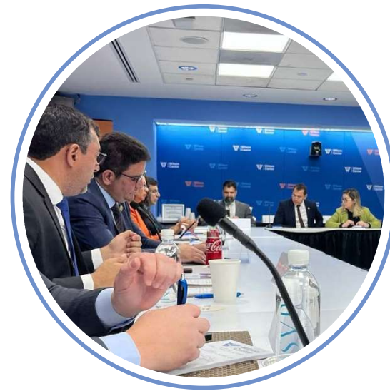
Policy innovation and experimentation