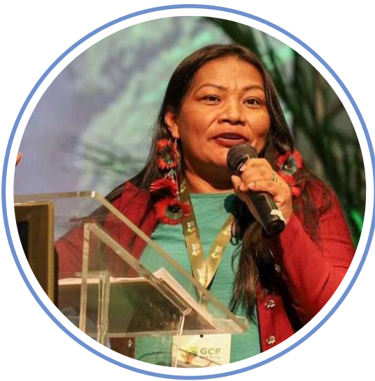
People and relationships