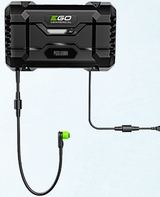
EGO PGX Commercial Charging