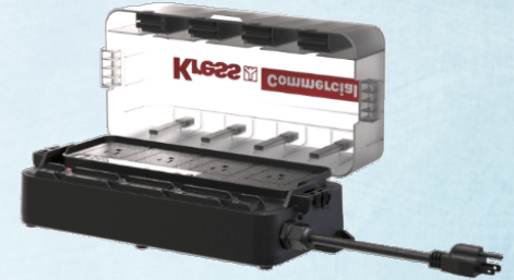
Kress Commercial AC Power Management System