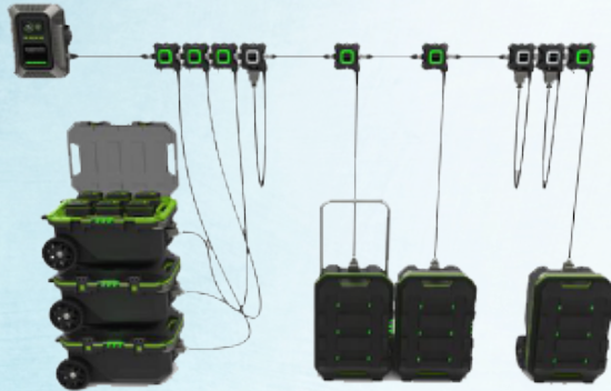
Greenworks ChargeLink System