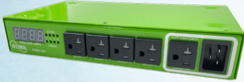
TOWA Power Distribution Manager