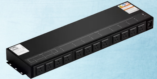
STIHL CM 12 Charging Management