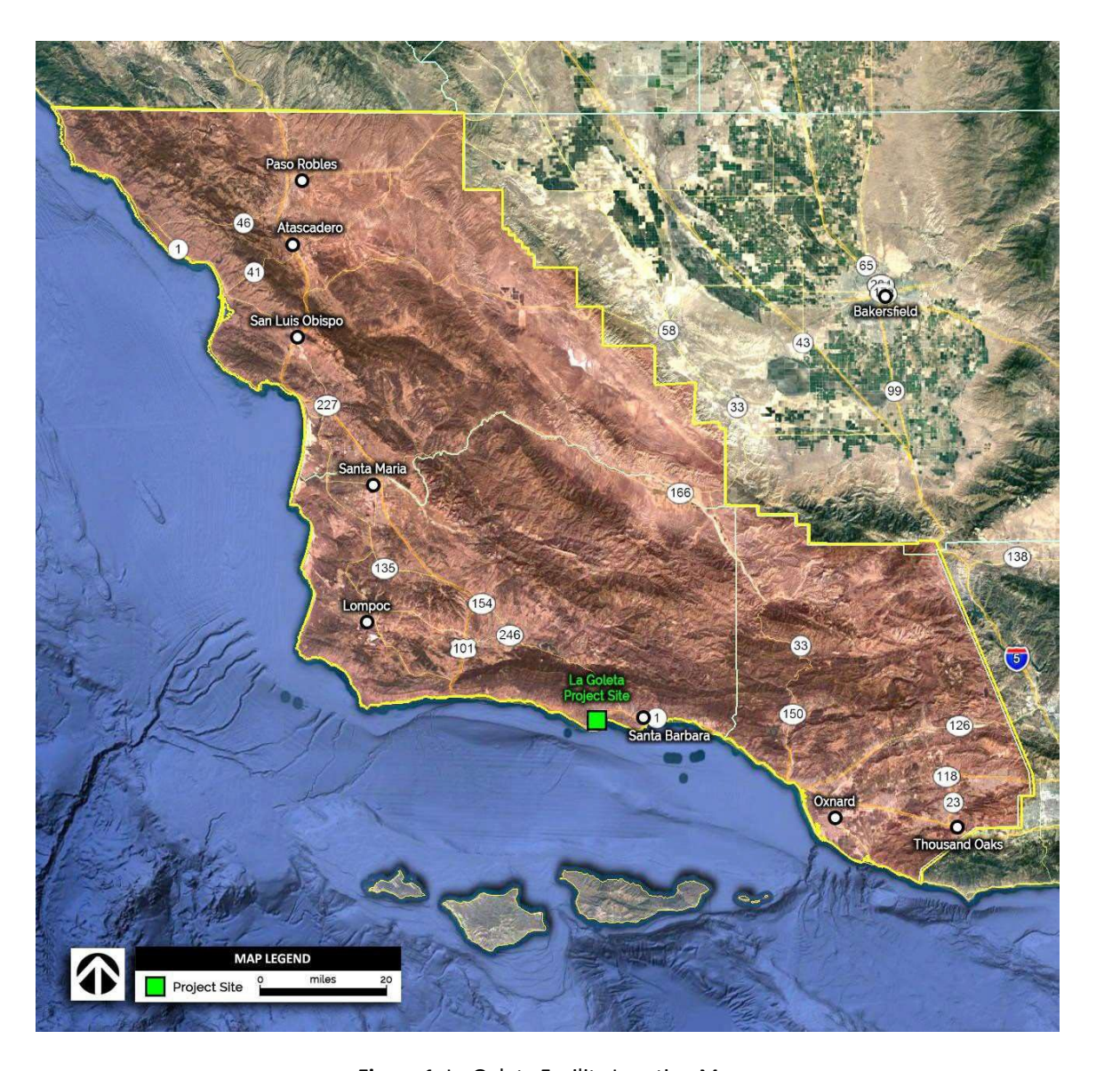
Figure 1. La Goleta Facility Location Map