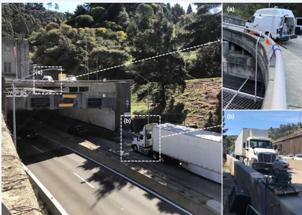
Figure 1. A van using monitoring equipment on an overpass at the Caldecott Tunnel Caltrans facility. Exhaust from a heavy-duty truck is sampled as it travels eastbound on Highway 24 and enters the tunnel. (a) The Van; (b) the roadside camera placed at the entrance to the tunnel.

Researchers at the University of California, Berkeley (UCB) measured emissions from HD trucks using a plume capture system at the Caldecott Tunnel in Oakland, California (Figure 1). This system collects part of the