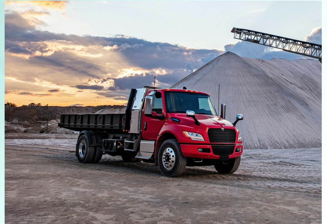
ZEV photo credit: eMV™ Series | International®