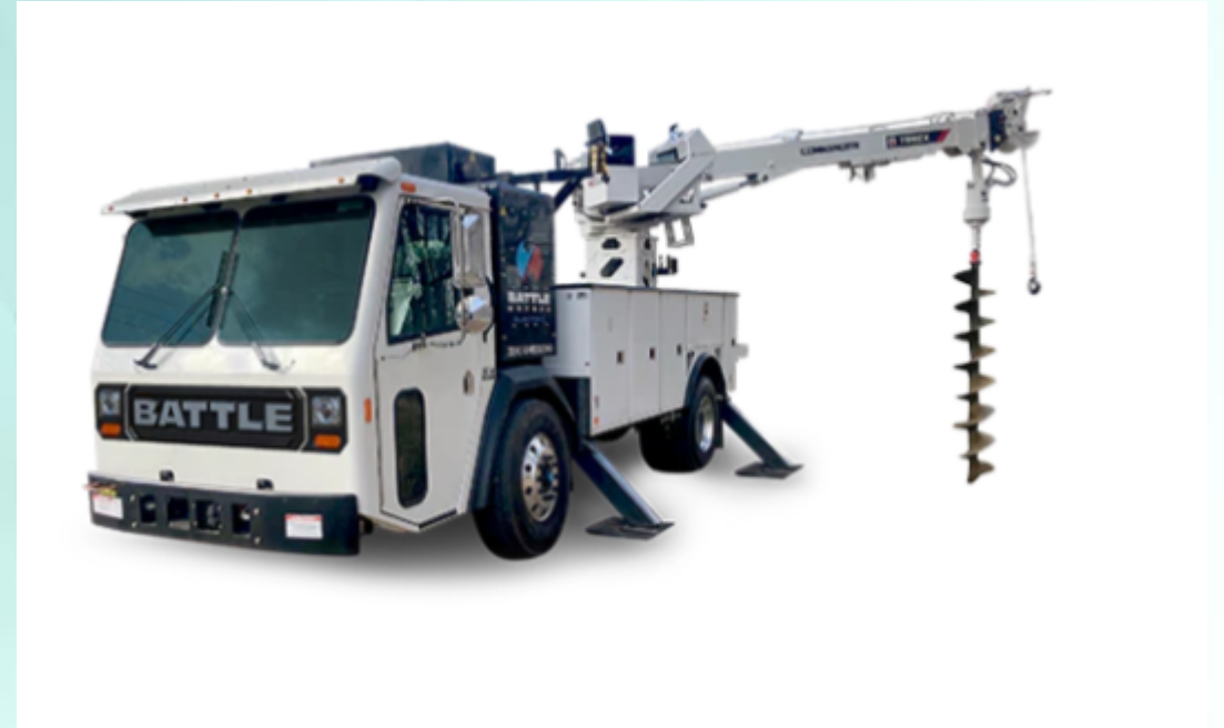
ZEV photo Credit: Battle Motors