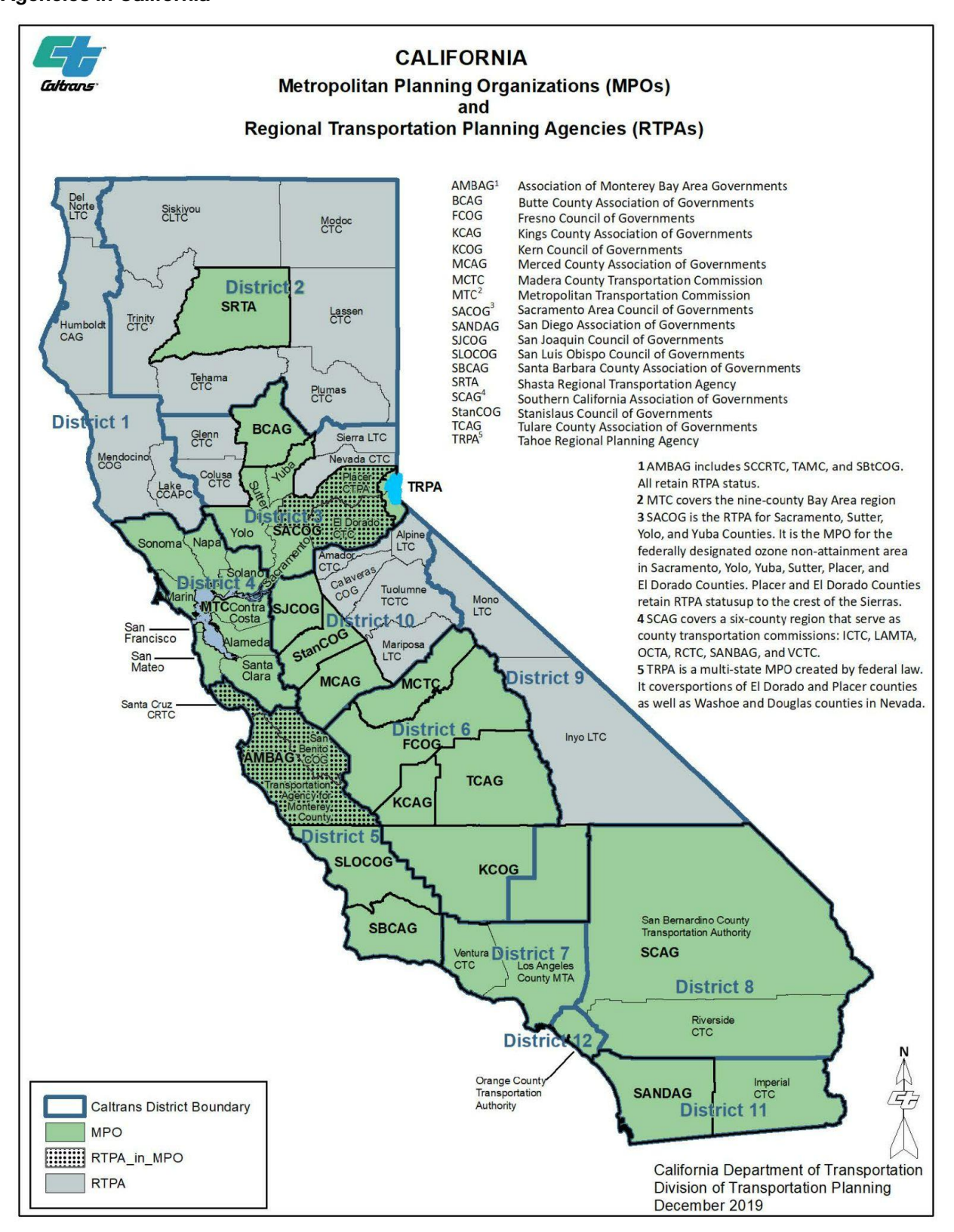
Figure 1-1: Map of Metropolitan Planning Organizations and Regional Transportation Planning Agencies in California