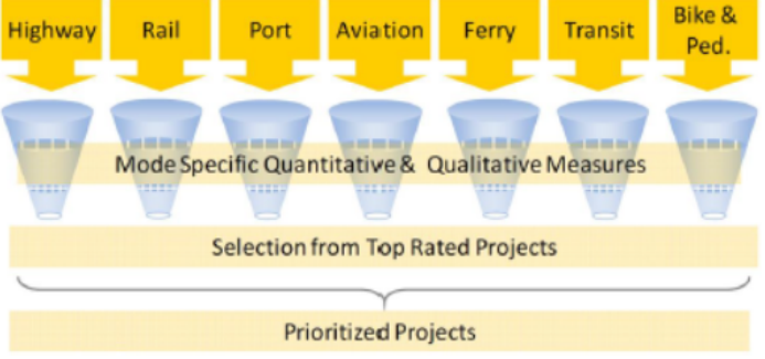
Figure 2-1. Modal Siloes in Project Prioritization (source: Gunasekera et al., 2014)

The prioritization scholarship recommends general best practices like aligning selection criteria with long-term transportation goals and emphasizing user impacts in scoring (Broniewicz & Ogrodnik, 2020; Meyer, 2016; Sperling & Ross, 2018). Yet, the literature also acknowledges that "no single [prioritization] approach is 'best'; as agency goals and operating conditions vary greatly, it is essential that the process be flexible and appropriate to those conditions" (Gunasekera & Hirshman, 2014, p. 64). While transportation scholarship highlights technical aspects of project assessment, project decision-making within MPOs has an inherently political dimension as well. These regional bodies do not depend exclusively on rational-technical project assessments or model results to select projects for RTPs and FTIPs; they rely on governing bodies mostly composed of elected officials to make decisions, following a "process-based approach."