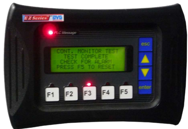
End of Test Message