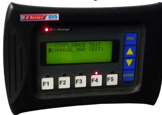
FIGURE 15-11 F4 - GM Bag Test