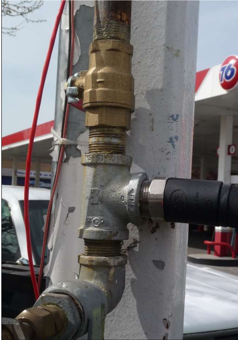
FIGURE 15-6 Test Hose on 1" Test Port

4.11. Connect the provided test hose to the pipe tee on the air outlet.