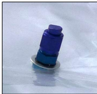
FIGURE 15-3 Large Cap with Flare Fitting