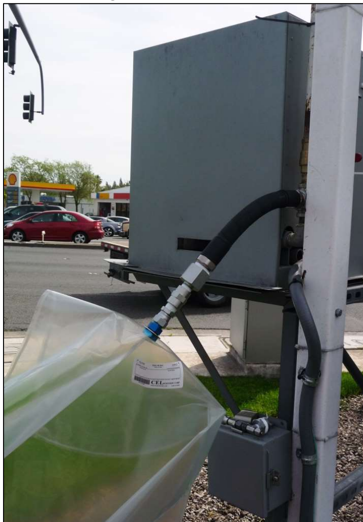
FIGURE 15-10 Tedlar Bag attached to Green Machine