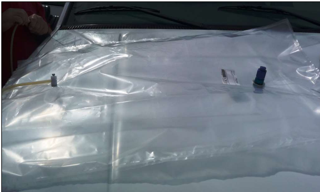
FIGURE 15- 1 Tedlar Bag with Connections