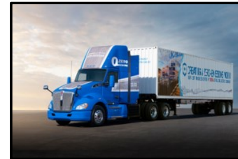
Gen 2 2 Trucks