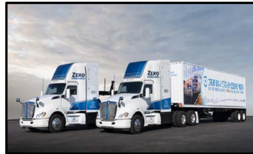
Gen 1 10 Trucks