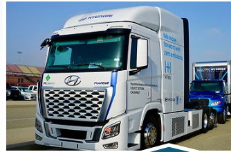
$157M for Drayage Trucks