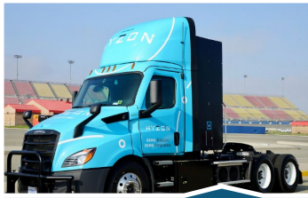
$265M for HVIP Standard