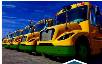
$1.125B for Local Educational Agency School Bus Replacement Grants