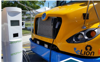
$135M for Public School Bus Set-Aside