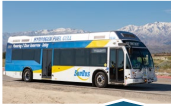
$70M for Public Transit Buses