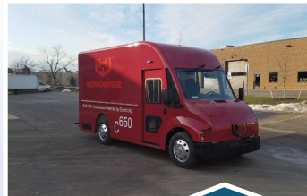
$35M for Innovative Small e-Fleets Zero-emission truck funding for small fleets