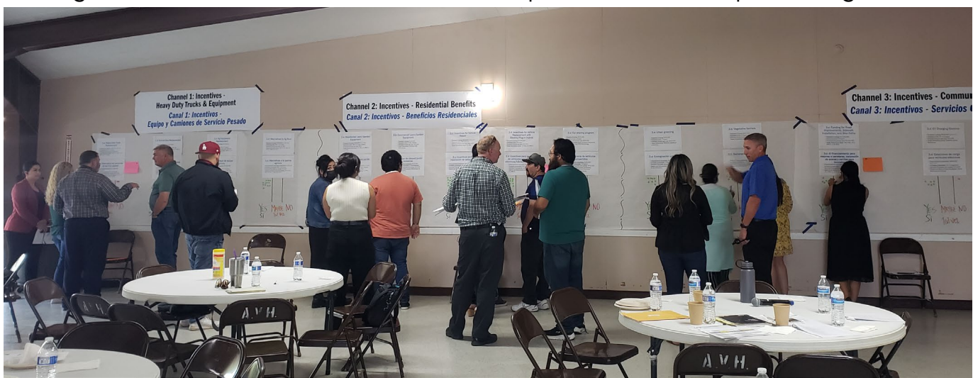
Figure 3 Arvin/Lamont CSC members gather in person to discuss proposed CERP measures with the Valley Air District, CARB, and other agencies.

The District hosted Arvin/Lamont's first in-person CSC meeting at the Arvin Veteran's Center to present the outcome of this budgeting exercise. They posted the proposed measures for initial deliberation along the walls including the text and the funding values. District staff, CARB and other agencies stood with the measures to answer questions and take input, see Figure 4. To