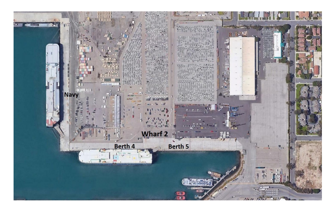
Figure 5-1: Port of Hueneme North Terminal (Wharf 2)

The Port plans to implement two strategies to comply with the At Berth Regulation at the North Terminal, including shore power at Wharf 2 and deployment of a barge-based ECCS for vessels that are not shore power compatible. The North Terminal (Wharf 2), consisting of Berths 4 and 5, is shown in Figure 5-1. Spatial and operational constraints at Wharf 2 allow only one ro-ro vessel to be berthed at the terminal at one time.