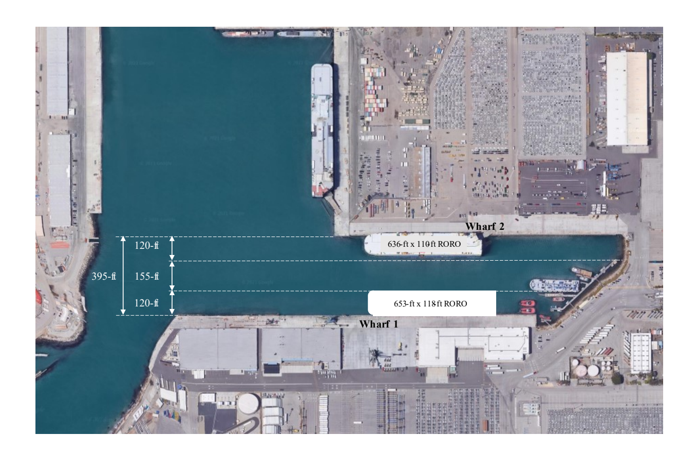
Figure 4-1: Channel width constraint when vessels are simultaneously berthed at Wharfs 1 and 2