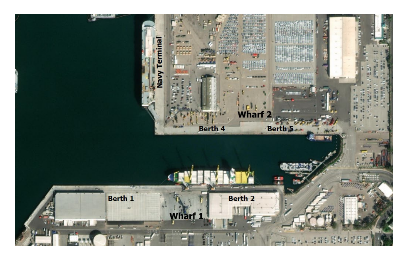
Figure 1-1: Port of Hueneme terminals

The Navy Terminal has had fewer than 20 calls from regulated vessels in the past calendar year and therefore is considered to be a low-use terminal. Low-use terminals do not have emissions control requirements; however, opacity and visit reporting requirements still apply. It is important to note that Navy Terminal is located on Navy Base Ventura County and is therefore neither on Port property nor under Port jurisdiction. The Port must request approval from Navy Port Operations to allow any vessel to be berthed at the Navy Terminal.