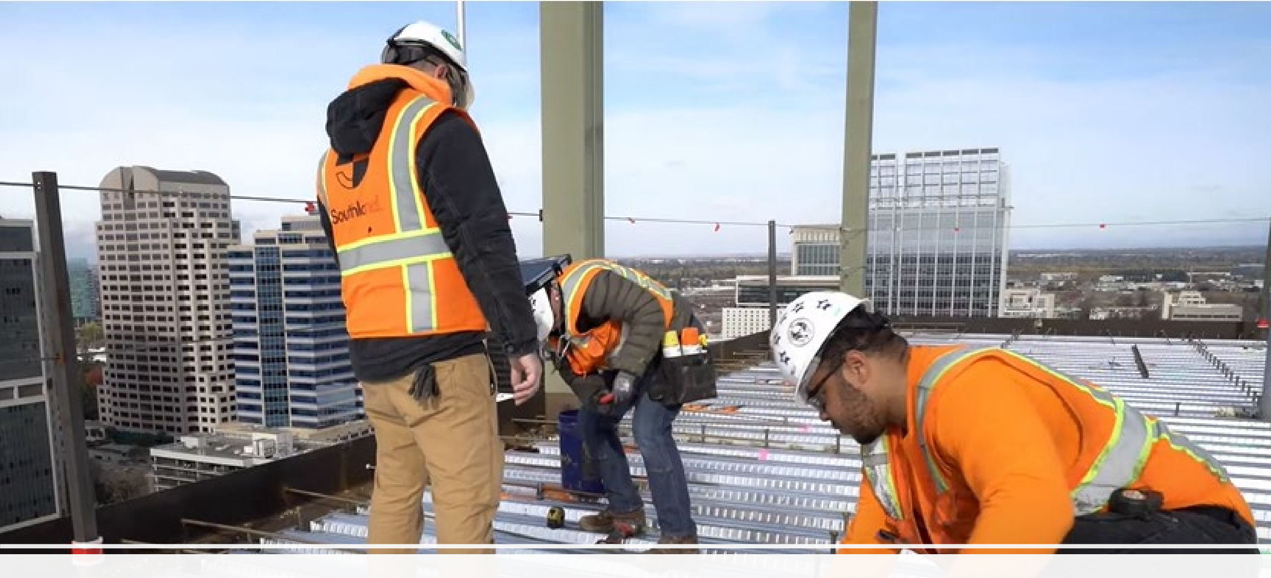
The greatest opportunity to increase equity is demand for accessible, high-quality jobs.