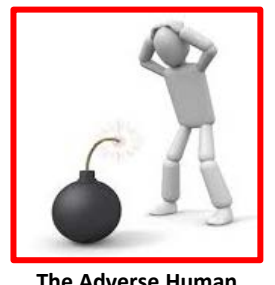
The Adverse Human Reactions to Climate Change

They want to increase their sense of wellbeing above previous levels!