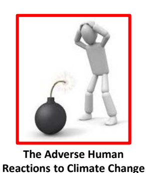
_ _ _ _

threaten our ability to reduce the climate crisis to manageable levels.