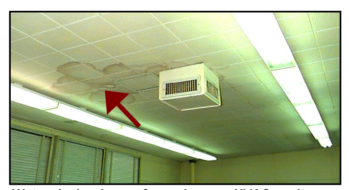
Water leaks in roofs and near HVAC units are common causes of moisture and mold problems.