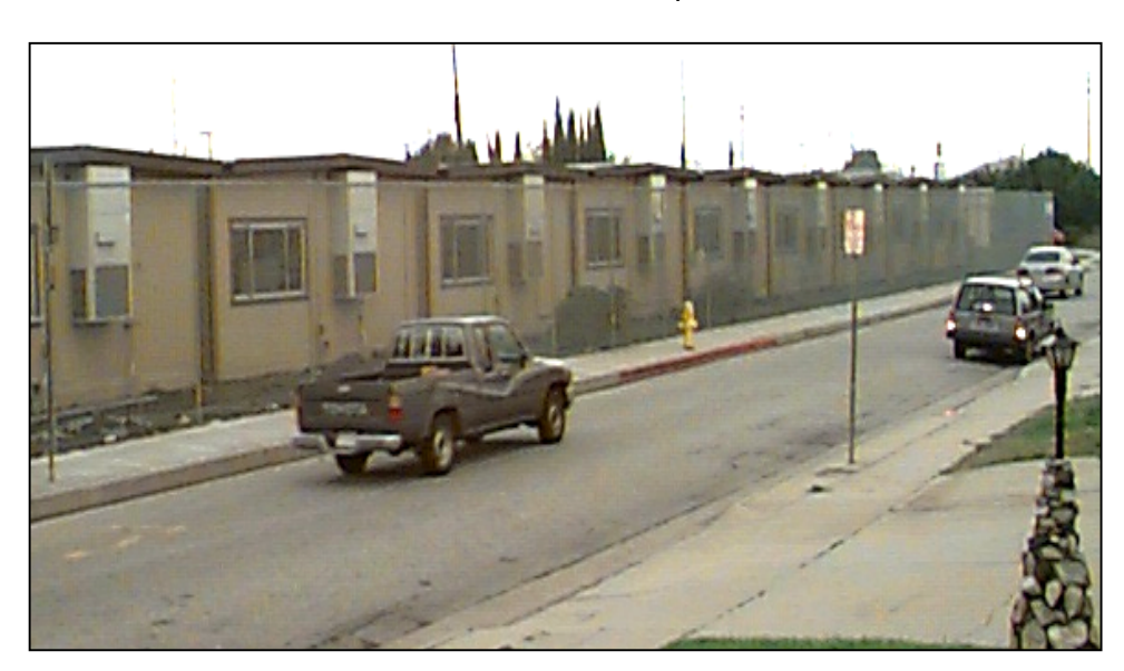
Vehicle traffic near classrooms can lead to exposure to harmful air pollutants.

For more information, go on-line to <a href="http://www.arb.ca.gov/research/indoor/pcs/pcs.htm">http://www.arb.ca.gov/research/indoor/pcs/pcs.htm</a>. See especially Appendix VI for specific guidance to schools.