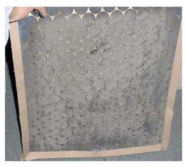
Dirty air filters can reduce airflow.