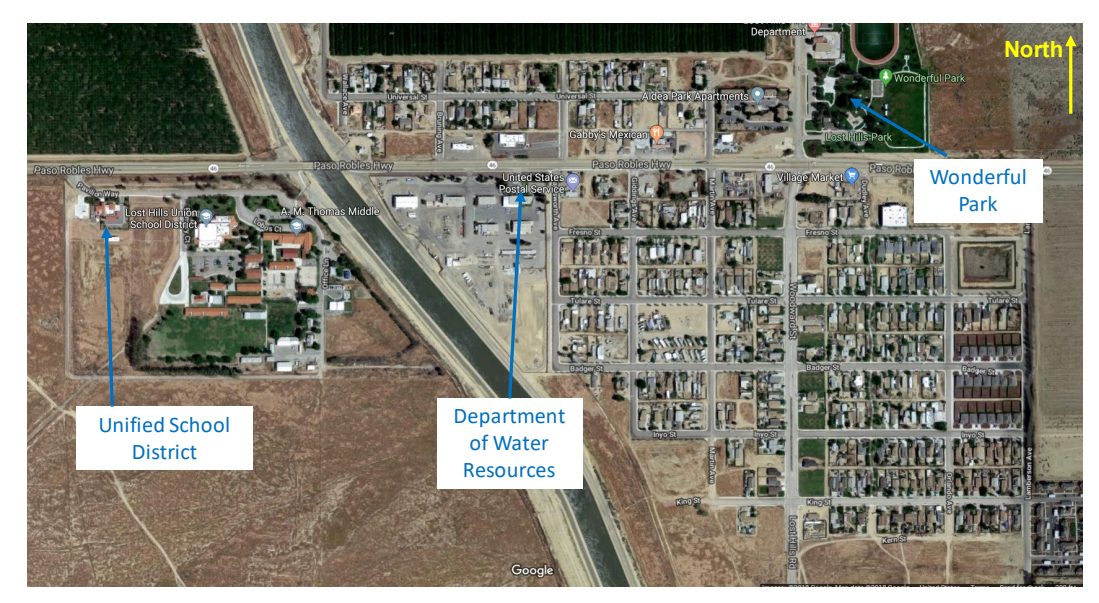
Figure 3: Map of Lost Hills Community with proposed sample sites listed.