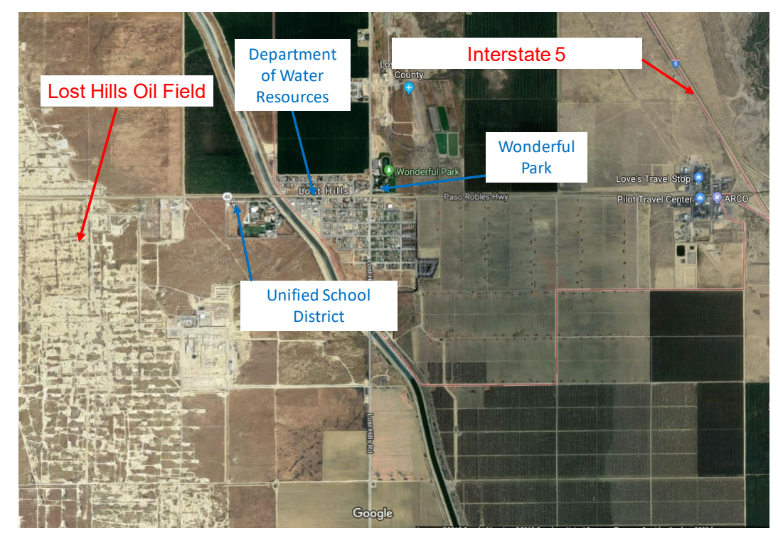
Figure 2: Map of the greater Lost Hills area. The Lost Hills Oil Field is located 1 mile west and Interstate 5 is located approximately 2 miles east of the community. The proposed sampling sites are labelled and shown.