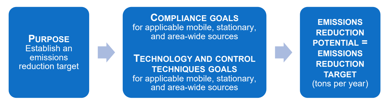
Figure C-4 Process for Establishing an Emissions Reduction Target

The purpose of the compliance goals, technology deployment and control techniques are two-fold: first, to determine the magnitude of the emissions reduction targets; and second, to provide numerical, visible actions that community members and other stakeholders can track as the community emissions reduction program is implemented.