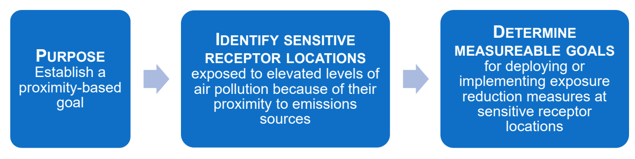
Figure C-5 Process for Establishing a Proximity-Based Goal

sources, to goals for a reduction in the number of trucks along a route, or a reduction in fence-line concentrations. Figure C-5 provides an overview of the process for establishing a proximity-based goal.