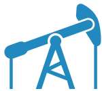
OIL & GAS FACILITIES