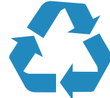
SMALL INDUSTRIAL FACILITIES LIKE RECYCLERS