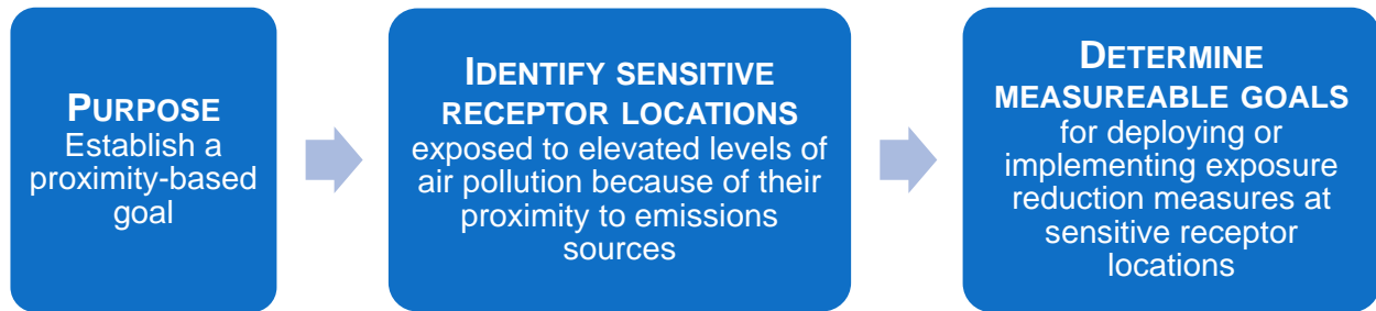
Figure C-4 Process for Establishing a Proximity-Based Goal

These measurable goals could range from the installation of a certain number of air filtration systems, to goals for specific minimum setback requirements from significant sources, to goals for a reduction in the number of trucks along a route, or a reduction in fence-line concentrations. Figure C-4 provides an overview of the process for establishing a proximity-based goal.