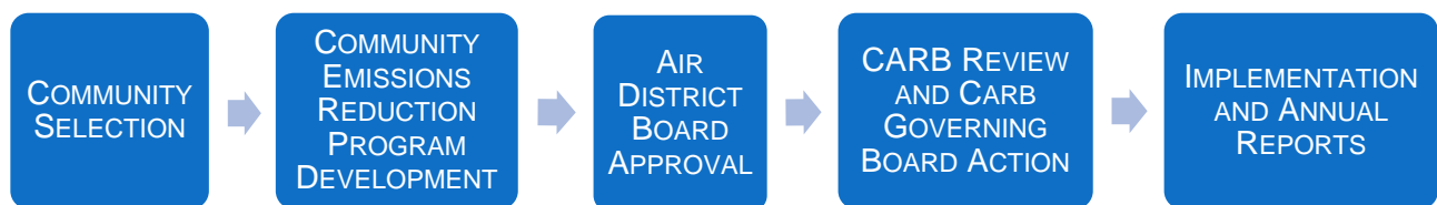
Figure C-1 Overview of Community Emissions Reduction Program Process

The purpose of the community emissions reduction programs is to focus and accelerate new actions to provide direct reductions in air pollution emissions and exposure within overburdened communities. AB 617 directs CARB to develop criteria for the community emissions reduction programs and includes a set of minimum criteria and elements, while providing the flexibility for CARB to establish additional criteria, as needed. 4