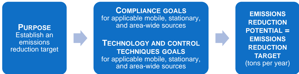
Figure C-3 Process for Establishing an Emissions Reduction Target

The purpose of the compliance goals, technology deployment and control techniques are two-fold: first, to determine the magnitude of the emissions reduction targets; and second, to provide numerical, visible actions that community members and other stakeholders can track as the community emissions reduction program is implemented.