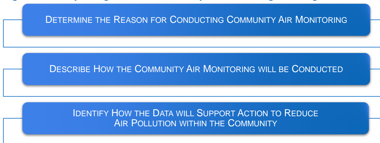
Figure 7 Key Categories for Community Air Monitoring Planning Elements