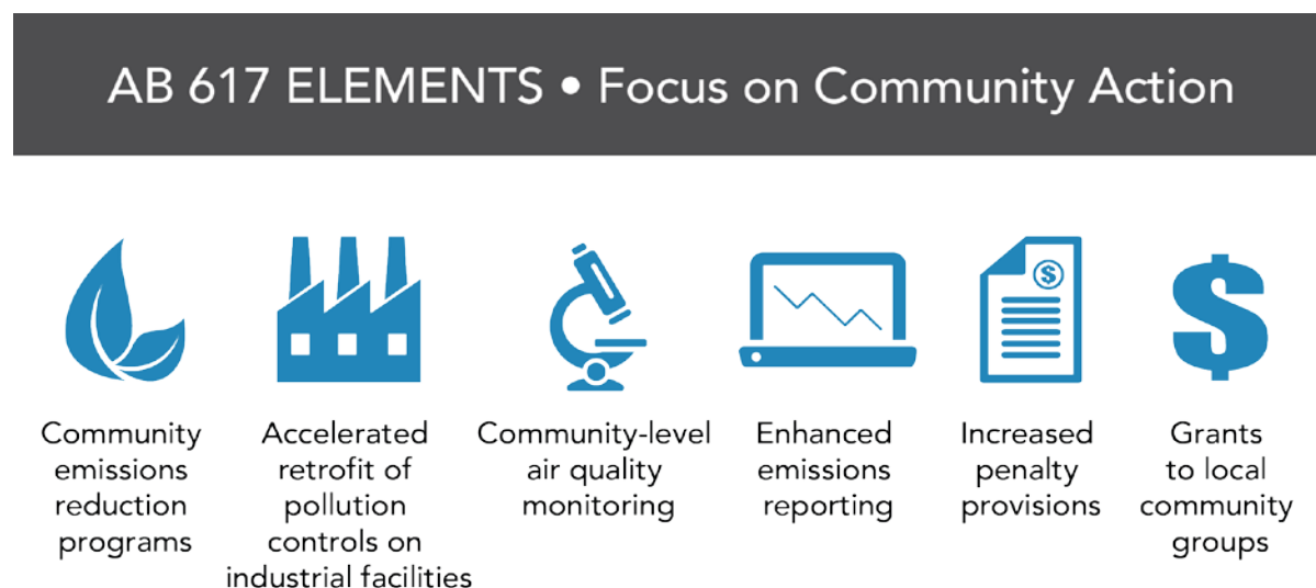
Figure 1 Community-Focused AB 617 Elements

Most importantly, underpinning AB 617 is the understanding that community members must be active partners in envisioning, developing, and implementing actions to clean up the air in their communities. Figure 2 outlines the core elements of a new Community Air Protection Program (Program), the California Air Resources Board's (CARB) program to implement AB 617. As part of this process, we will align Program priorities and objectives with other CARB and air district actions to help achieve emissions reductions in disproportionately burdened communities, improve accountability and transparency, and promote collaborative partnerships between air districts, CARB, and community stakeholders.