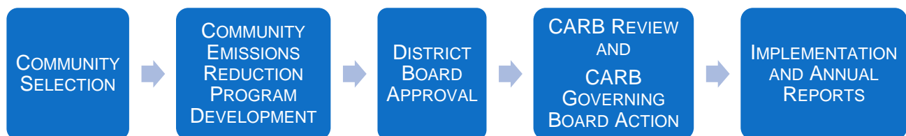
Figure 5 Overview of Community Emissions Reduction Program Process

The overall elements for inclusion in the community emissions reduction programs are summarized in the checklist provided in Table 1, with a detailed checklist provided in Table C-1. CARB will review each air district's community emissions reduction program to ensure they meet the requirements and will reduce air pollution exposure in the designated community. The detailed checklist will form the basis for CARB's review process and, after a public comment period, each community emissions reduction program will be presented to the CARB Governing Board for action. The CARB Governing Board may take one of four actions in considering a community emissions reduction program: approve, conditionally approve, partially approve, or reject (collectively represented as a CARB Governing Board action). CARB is committed to working closely with the air districts and the community steering committees throughout community emissions reduction program development to expedite the review process.