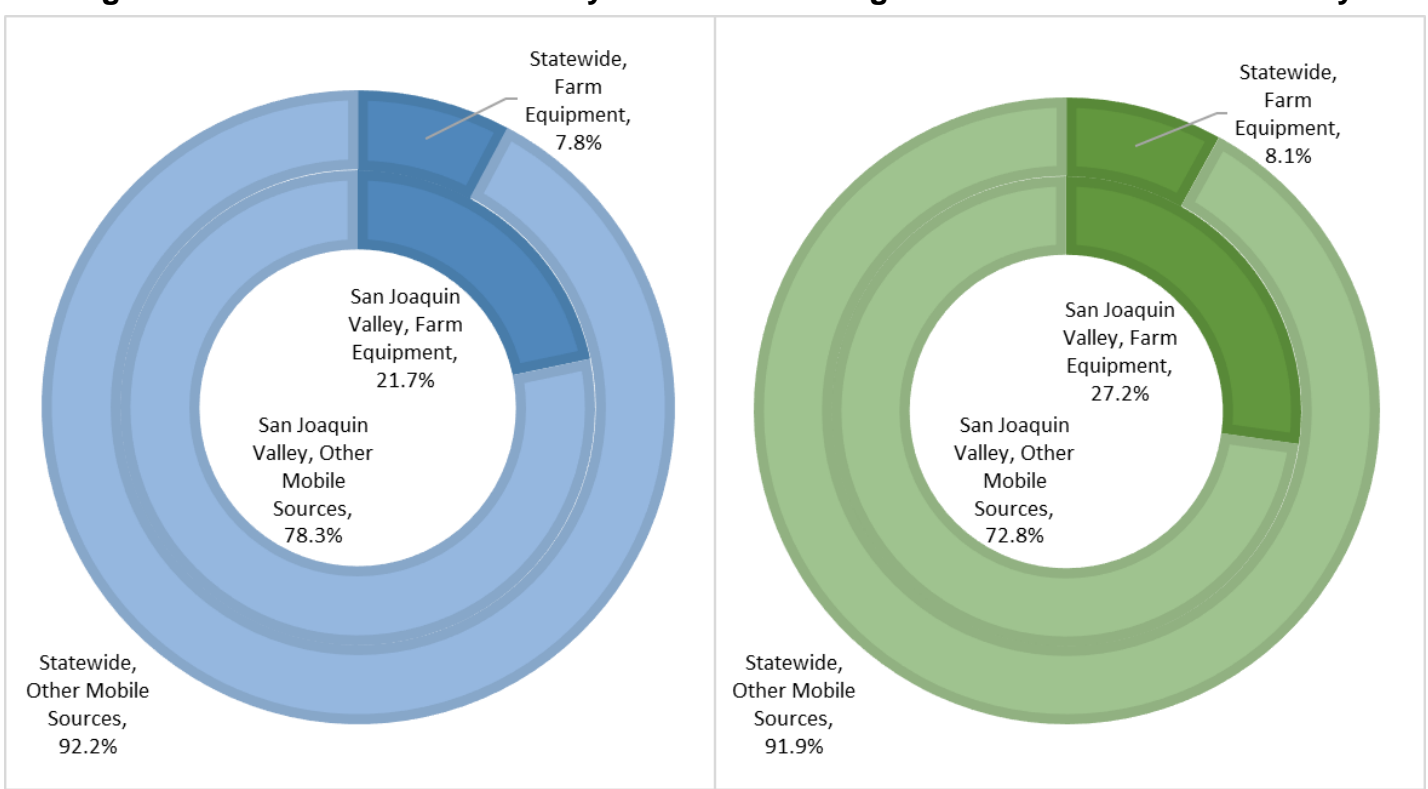
Figure 2: PM Emissions Inventory