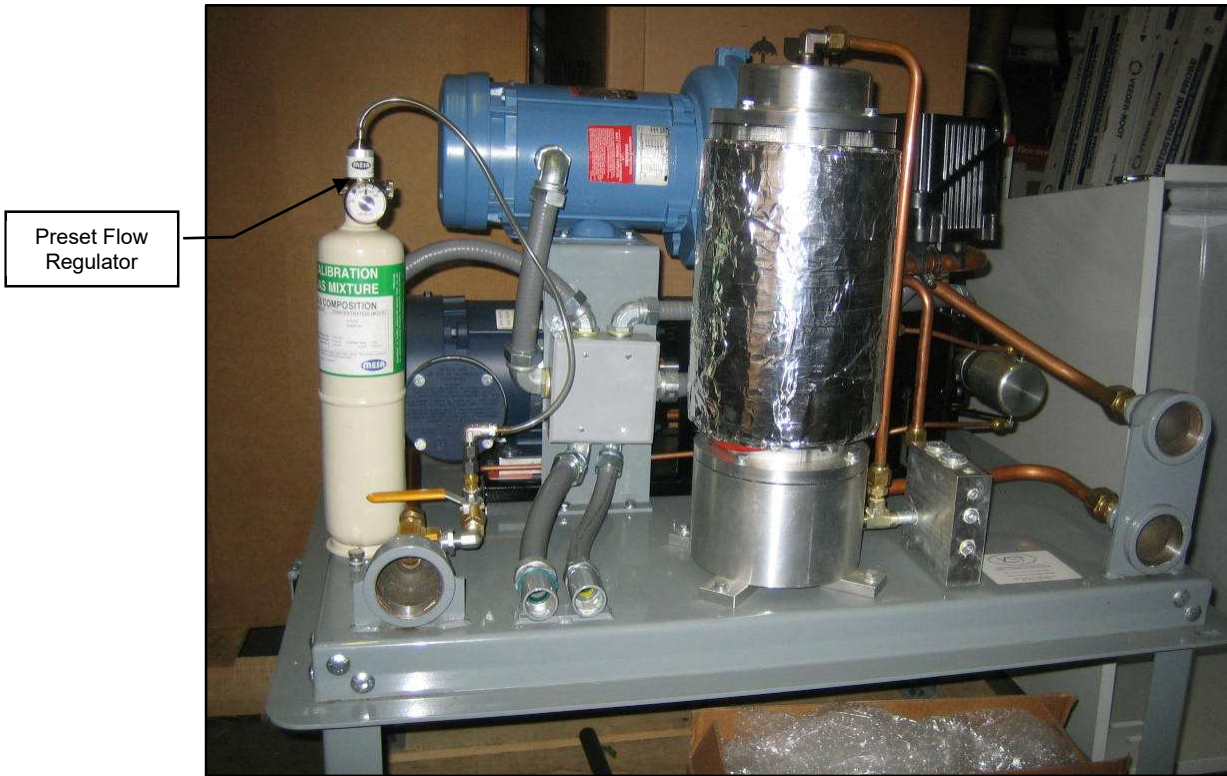
FIGURE 8-2 Equipment Configuration for Verifying Hydrocarbon Sensor

Note: Preset flow regulator configuration