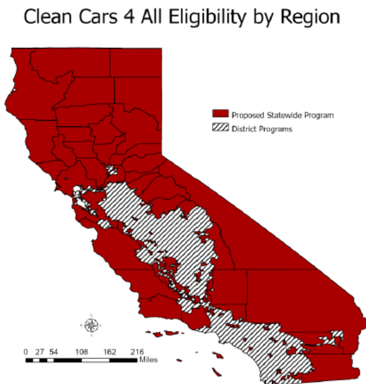
Figure 1: Clean Cars 4 All District and Statewide Program Eligibility

The statewide program aims to focus the benefits on those with the greatest need. Program eligibility will be determined primarily based on income, limited to participants with household incomes at or below 300 percent of the federal poverty level, currently an annual income of $83,250 for a household of four individuals. In addition to focused income restrictions, the statewide program will require moving beyond the first-come, first-served models used in the existing district programs. A needs-based approach, developed in collaboration with Financing Assistance, will categorize applications based on income, disadvantaged community status and other criteria to prioritize and to meet the needs of participants who would benefit most from a more accessible Clean Cars 4 All program. Collaboration with CBOs and Access Clean California will help ensure that those in the greatest need are able to access the program. Improved survey and data collection methodology will continue to assist in cataloging the needs of participants and providing insight on how the program can be improved. This shift in program design specifically addresses community concerns with the current first-come, first-serve model by ensuring that funding is prioritized for Californians in most need, respecting the needs of local communities, as well as supporting California's climate and air quality commitments. The needs-based approach is under development still, but could use a combination of