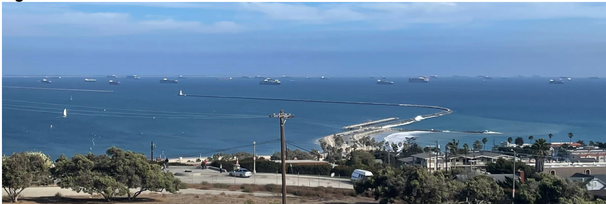
Figure 1. Container Vessels at Anchor in October 2021 near the SPBP 2