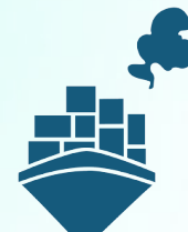
Ship at Berth