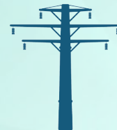
NG Thermal Power Plant