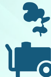
Diesel Backup Generator