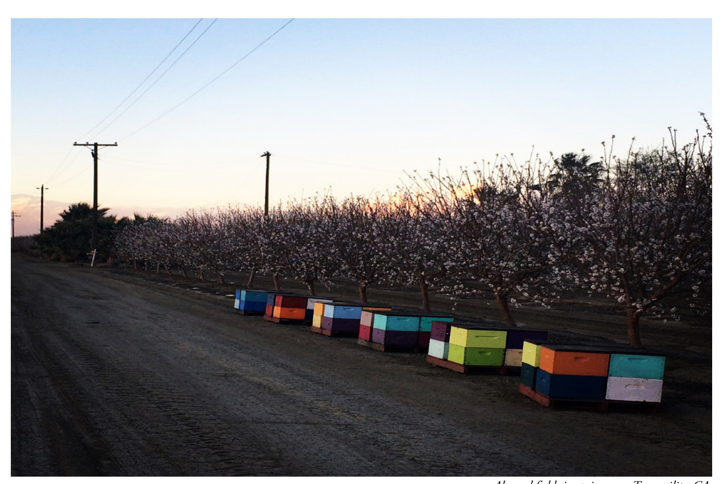
Almond fields in spring near Tranquility, CA